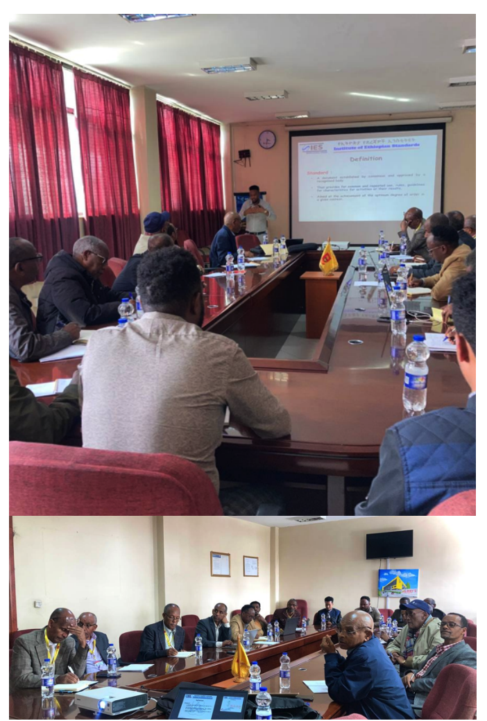
SMU in Stride

Participants actively engaged in interactive Q&A segments and case-based discussions, creating a dynamic platform for knowledge exchange and leadership alignment. The session is regarded as a foundational step in equipping SMU's decision-makers with the insights and readiness required to effectively navigate the upcoming stages of the ES ISO 21001:2018 certification process.