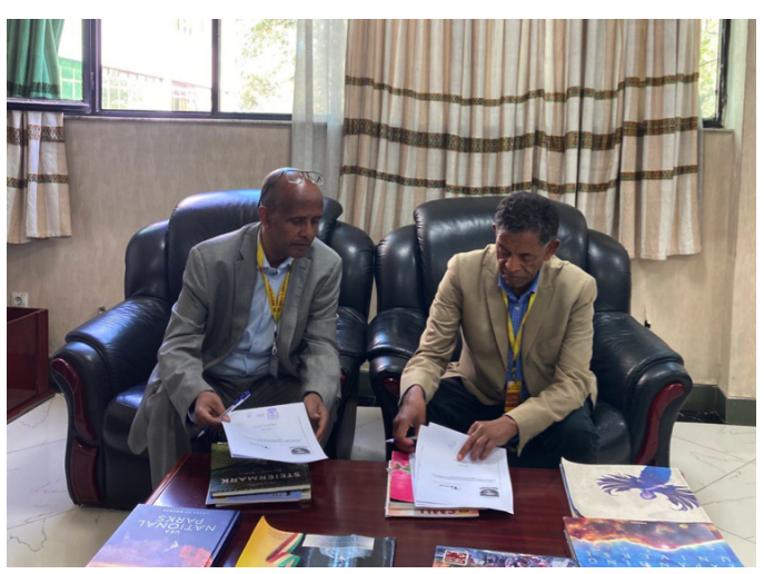
EU Comes to Your University—Ambassadors' Speech Series

The MoU outlines a clear framework for cooperation, ensures high-quality training delivery, expert selection, certification standards, and competitive bidding processes. This strategic partnership is expected to empower professionals and institutions across various sectors, foster knowledge-sharing, and strengthen workforce capacity.