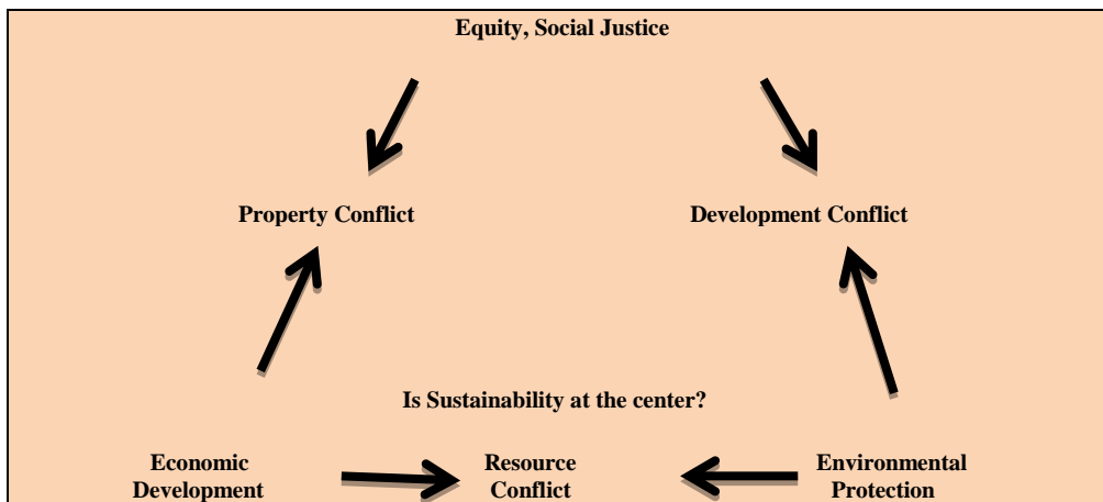
Figure 2: Adopted from Scott Campbell (1996), Planners address three fundamental priorities and three resulting conflicts.

The tendency to attain economic and social goals inherent to land use planning through multimodality can result in conflicts. The level, nature and motives of the social goals that may result in conflict should be curtailed. For instance, there can be "...obvious conflict of social goals inherent in land use planning law: regional versus local, public interest versus private rights, conservation versus change, quality versus quantity, and identity versus diffusion". 55 Such conflict between conservation and change is aggravated by the scarcity of urban land for industrial growth and the difficult task of preserving "land for the purpose designated on a land use plan in competition with free market forces". 56