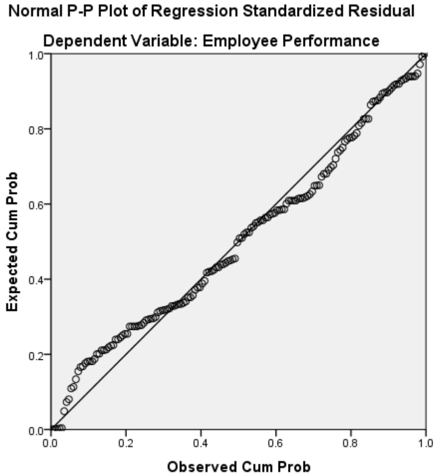
Figure 3 Normal P-P Plot of Regression Standardized Residual

As shown on Figure 3, the P-P plots follows a straight line which justifies the residuals were deemed to have a reasonably normal distribution, as suggested by Hair et al. (1998).