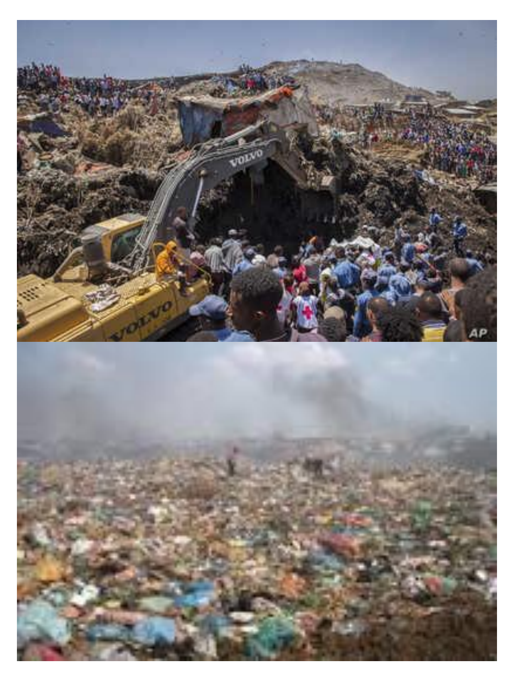
Poto.2 Magnitude of the Disaster

According to the youth volunteers' representative, the incident was more worthy than to disclose to the media and the other concerned body. It is reported that the youth volunteers are still victims psychologically.