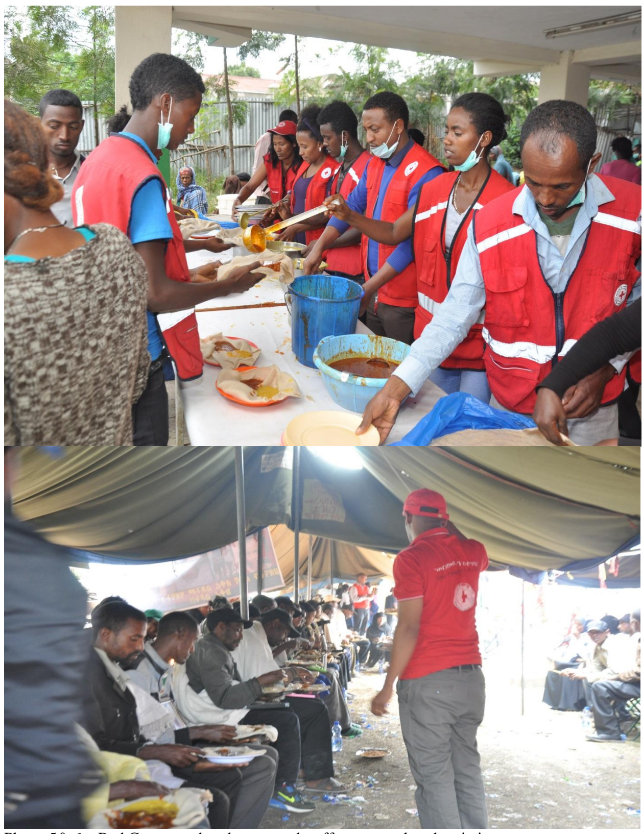
Photos5& 6. Red Cross youth volunteer and staff serve meal to the victims