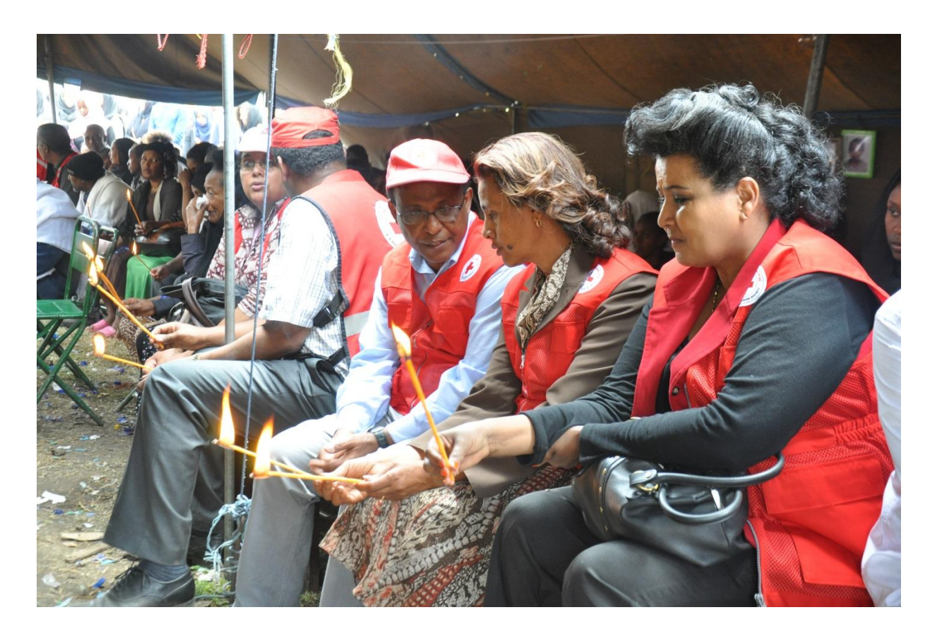
Photo 4 Red Cross Executive Committee Members participate in funeral gathering.