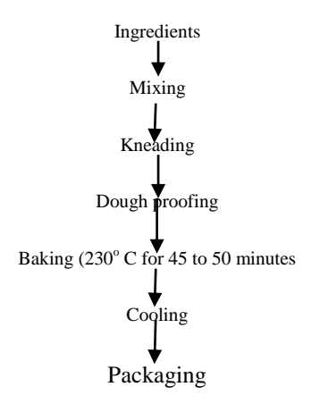
Figure 3: Flow chart for bread production (Oluwamukomi et al., 2005)

oven preheated to set condition of 230^{\circ} C and baking spanned for 45 to 50 minutes.