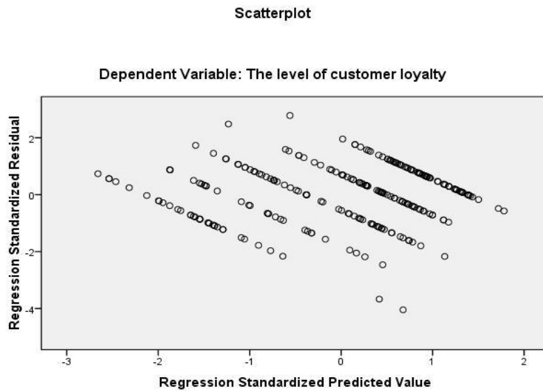
Figure 4.2 Hom oscedasticity

For the sample size above 30 is usually sufficient to ignore the assumption regarding normal distribution (Weinberg & Abramowitz2008). Since samples size of the study exceeds by far the suggested number hence it assumes normality.