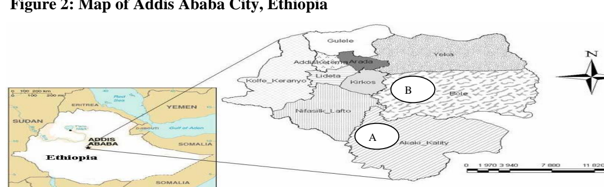
Figure 2: Map of Addis Ababa City, Ethiopia

The City Administration is made up of urban and peri-urban areas; and it is divided into ten (10) sub-cities, namely; Addis Ketema, Akaki-kality, Arada, Bole, Gulele, Kirkos, Kolfe-Keranio, Lideta, Nifasilk-Lafto, and Yeka sub-cities (see Figure 2). Seven of the sub-cities except Arada, Addis Ketema and Kirkos sub-cities have urban agriculture offices under their sub-city capacity building program offices. The population of Addis Ababa in 2011 was 3,040,740 of which 1,448,904 were males and 1,591,836 females (CSA, 2012).