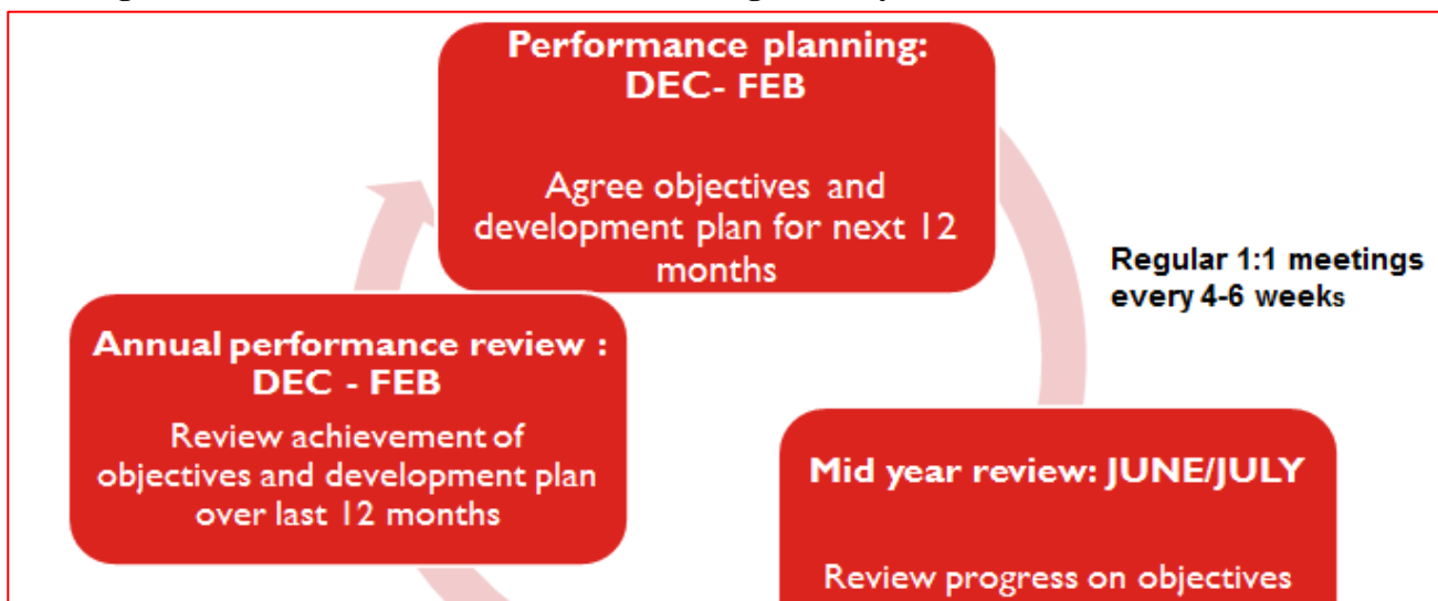
Figure 2. Save the Children Performance Management Cycle

The manual also indicated the preparation that has to be made by both Manager and employees to make the performance discussions successful. It is clearly indicated in the manual about who leads which process and the time table in which each process shall be conducted.