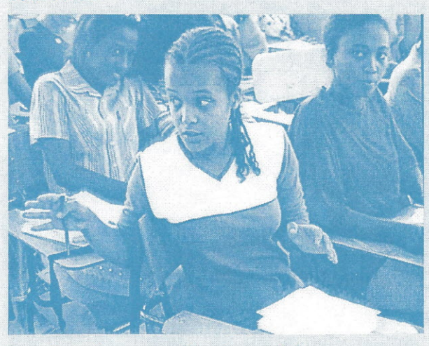
Female students attending the workshop

After some basic ideas were forwarded by the resource persons, active discussion soon ensued. The backward culture, among many other things, was sited as the primary source of