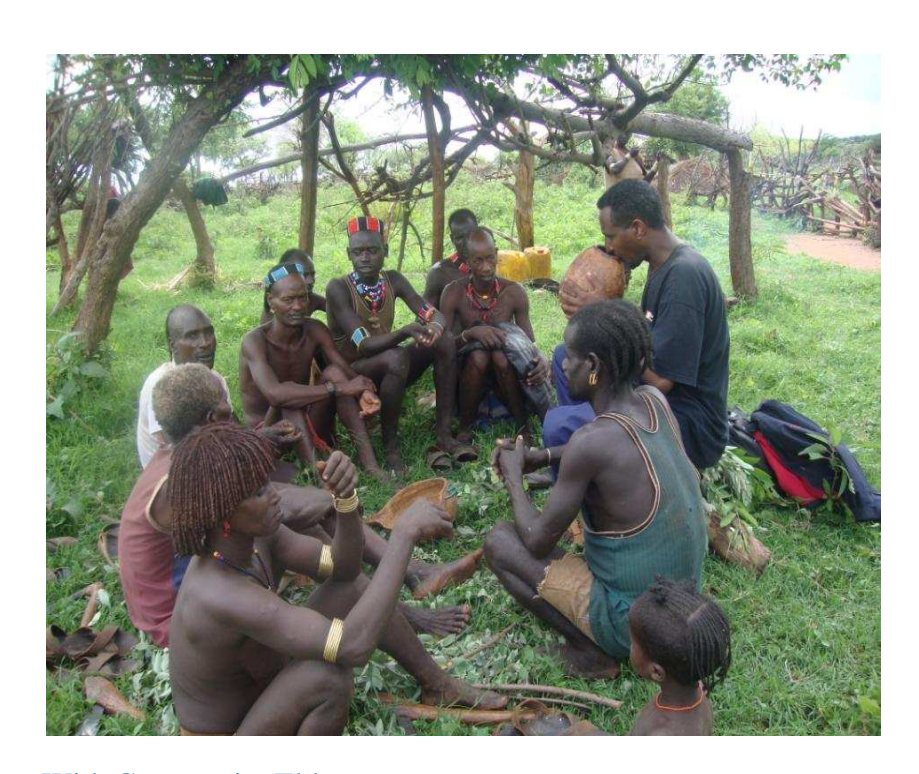
With Community Elders