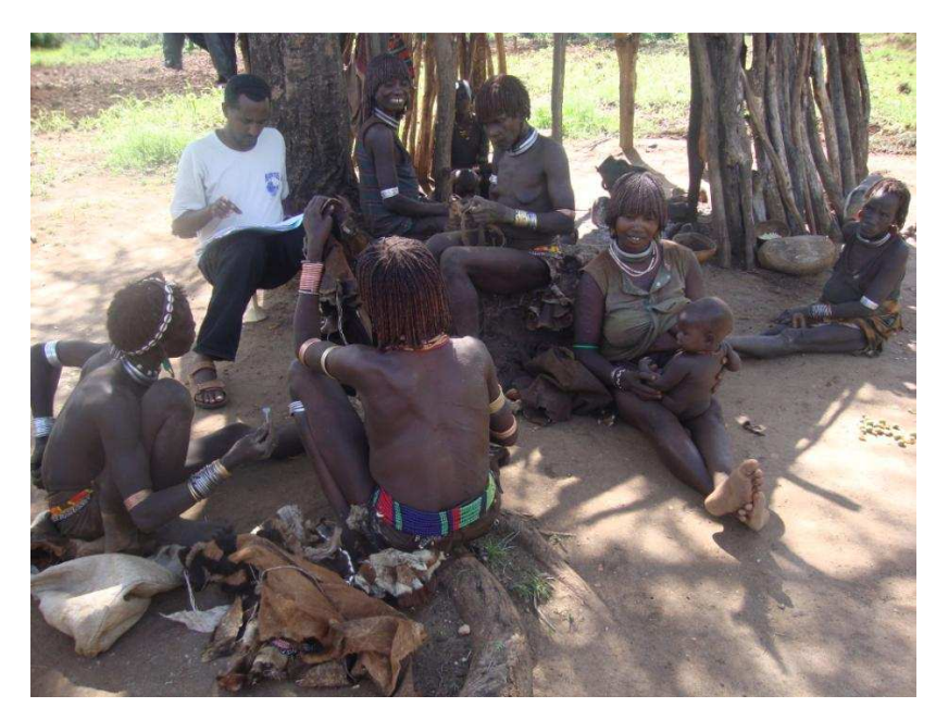
With Women Groups