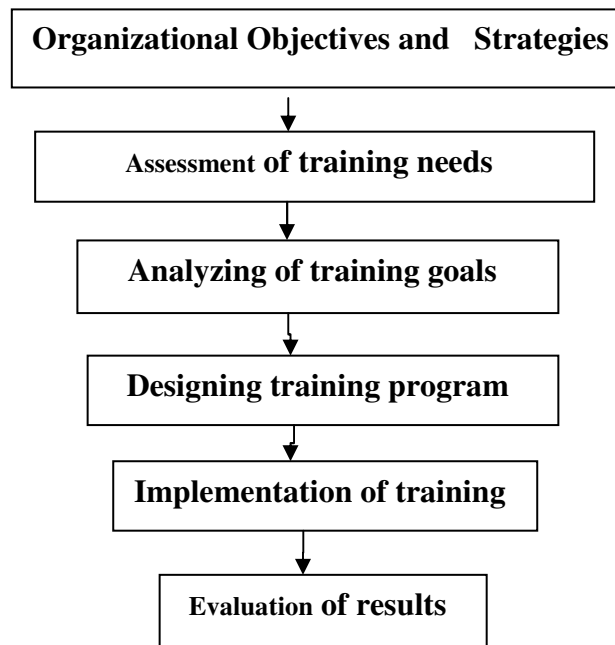
Fig 2.2 Steps of Systematic training process